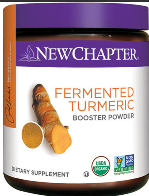
New Chapter Fermented Turmeric Booster Powder