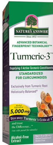
Nature's Answer Turmeric-3 Liquid