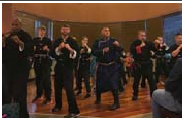
Chinese New Year celebration - February 10, 2018.