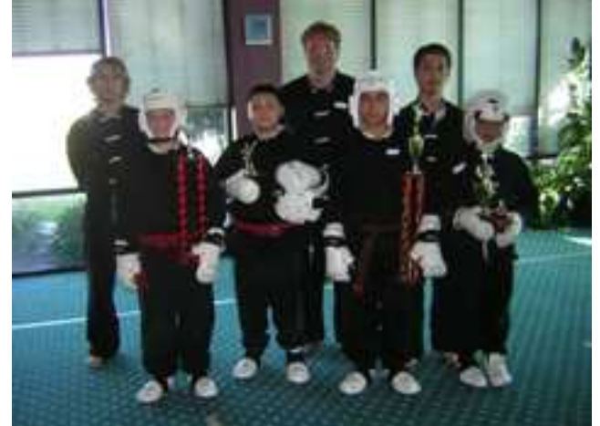
Inner-school tournament on 11/2/13.

Black Belt club & Accelerated program rank test: