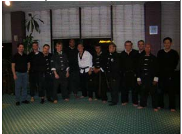
Bill Wallace pictured with Black Belts.

The Bill Superfoot Wallace seminar was held Friday at Wang's Martial Arts. There was a separate class for both adults and children. 60 plus students attended as well as family and friends watching. Mr. Superfoot wowed the audience with fast unavoidable kicks. He kept the kids engaged with lively presentation. Everyone got a good stretch and fun workout. Superfoot signed coloring books and posed for photos.