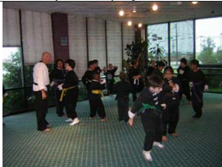
A work shop in progress.